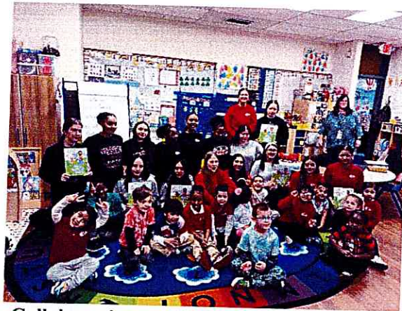
Collaborating with Derby High School for Read Across America

Bradley School: https://www.derbypride.org/our-schools/bradley-school#h.fc3zn7up45xr Newsletter: Please click to check it out! newsletter .