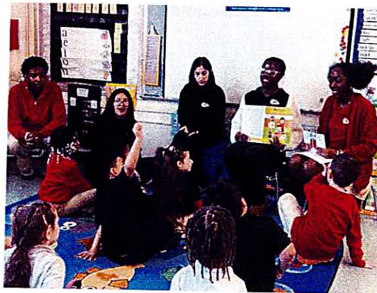
DHS @ Irving – Junior Achievement

Derby Middle School: https://www.derbypride.org/our-schools/derby-middle-school#h.z4nvo2f9doub