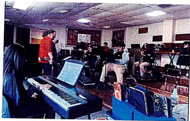
Practicing for Spring Pops Concert April 1st