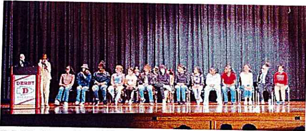
DMS One-Act Play & Talent Show